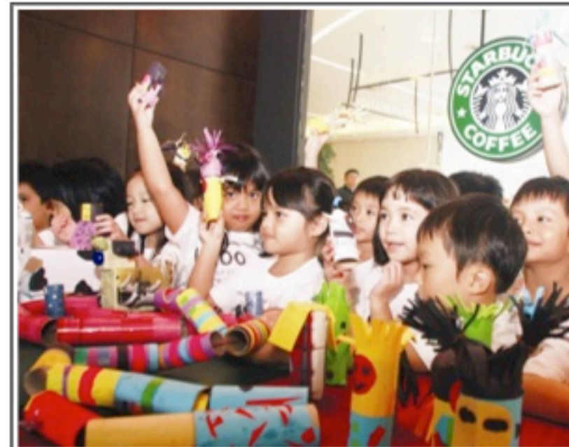
Tadika Krisaliz pupils showing their 'green side' at Starbucks Tropicana Mall last Thursday.