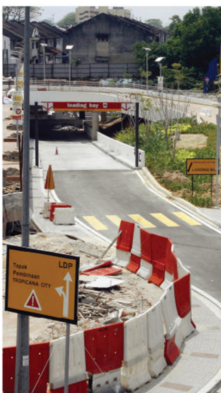
PROBLEM SPOT: Road that turns into LDP heading to SS2 also leads to a Tropicana City Mall parking entrance, potential congestion area

The company is also undertaking the construction of Casa Damansara 3, located near the mall.