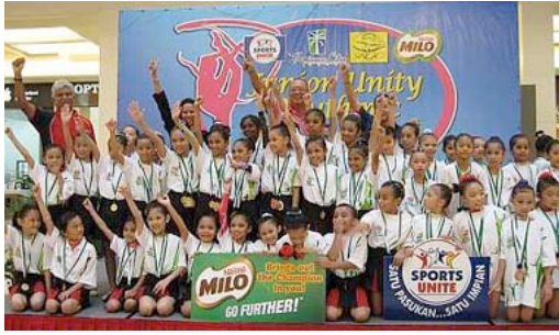
All smiles: The winners posing for a group picture

Participating teams were required to have representation from at least two different races as part of the organisers' effort to promote unity through sports.